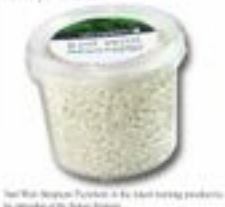
DermaQuest Stress Treatment is a professional-grade product that is formulated with natural botanicals and stem cells. The product is designed to help reduce the signs of aging, such as wrinkles, skin texture, and skin tone. The product is also rich with natural botanicals, which help to soothe and hydrate the skin, and help to reduce the signs of aging.